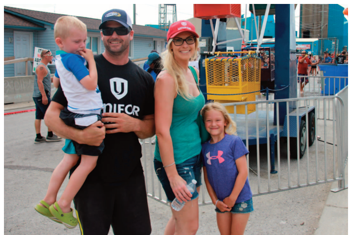
One of many families featured in a series of videos about how scabs hurt families posted during the Compass Minerals dispute.

Only about 2.1% of Unifor’s contract negotiations since 2013 have involved a strike or lockout, and employers used scabs in less than 10% of those disputes. However, it is clear that when they are involved, scabs make strikes and lockouts longer, more acrimonious, and more risky in terms of workplace health and safety. The employers’ ability to use scabs tips the balance of power too far in their favour and undermines normalized labour relations. It is time to level the playing field and pass anti-scab legislation, allowing working Canadians to bargain fair contracts that support themselves, their families and their communities.