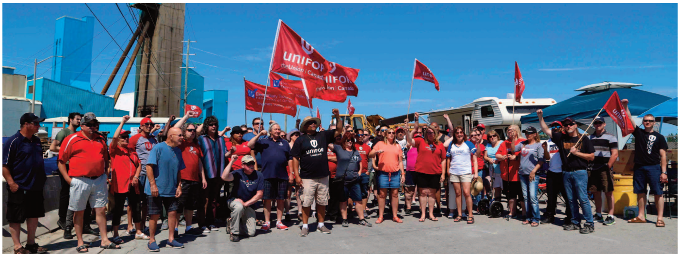
Members from across Ontario mobilized to support members of Local 16-0 in Goderich, Ontario in the summer of 2018.