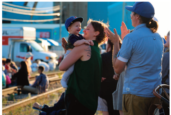
One of many family friendly events on the Goderich picket line in 2018.

For us, we were really sure there would have been some sort of serious accident at the mine. And the dispute would have been prolonged. But in terms of an accident, the fact is we were worried about the mine as a whole, and would we even have a place to go back to work? That was a serious concern that we still talk about today. These people the company had hired to come and do our jobs had no skills whatsoever and were working 12 to 16 hour days.