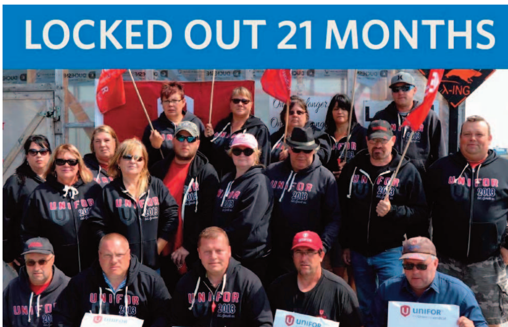
This Billboard was part of the campaign to end the D-J Composites Lockout.

This is a key finding. It suggests that once workers' bargaining power is restored through anti-scab legislation, there may be a slight uptick in the incidence of work stoppages (particularly in the first two years after legislation is introduced) but the length of the average labour dispute shortens significantly so that there is no overall increase in the number of days lost.