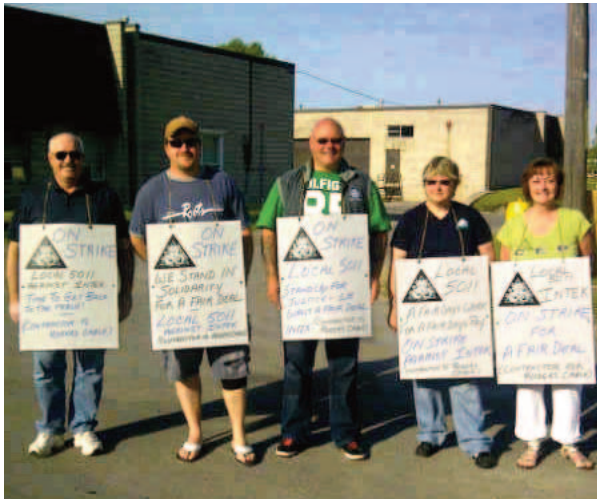
Members across Ontario at Intek Communications and DHT were locked out for 457 days in 2012.

Although empirical studies are important to get a sense of whether there are any discernable effects of anti-scab legislation on aggregate statistics such as the number and duration of labour disputes, the studies cited above suffer from a number of issues that limit our ability to draw meaningful conclusions about the importance of anti-scab legislation. For one, their sample size is often limited to a small number of jurisdictions and disputes involving large bargaining units (typically more than 500 members), which means that they are drawing on a relatively small pool of data that is subject to a large number of external variables which might be causing the observed effects.