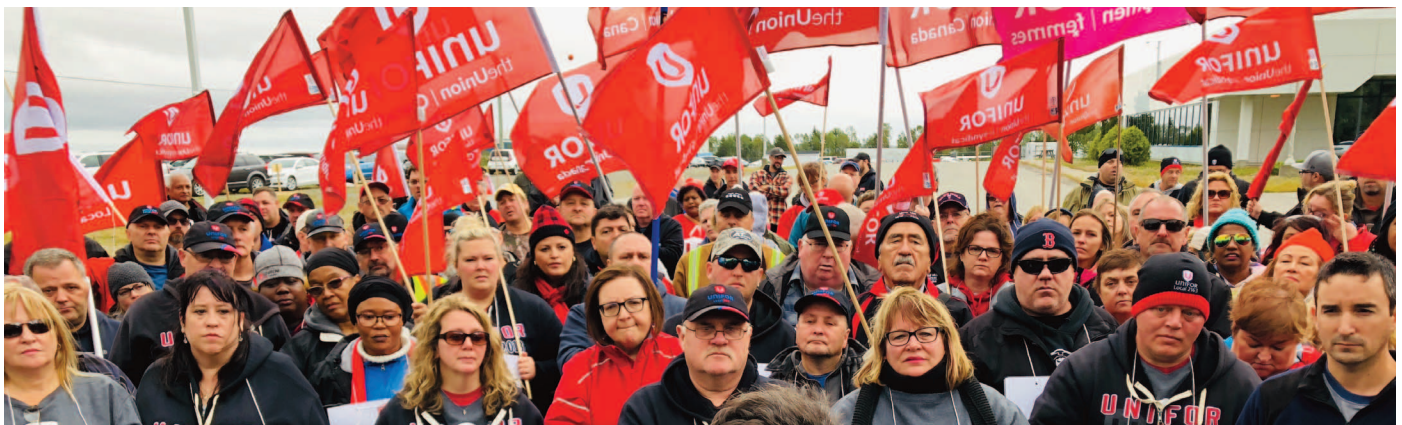
Unifor members block the entrance to D-J Composites and wave Unifor flags during a rally streamed live on Facebook.

Examples such as the Giant Mine tragedy reveal the incalculable costs of failing to have anti-scab legislation in place, which cannot be captured by studies that simply look at the incidence or duration of labour disputes. Both Unifor's experiences and those of the broader Canadian labour movement show a clear trend towards escalating tensions and potential violence when scabs are brought in by employers, as well as enduring adverse impacts on the broader community, particularly in smaller cities and towns. Based on these negative outcomes alone, anti-scab legislation should be present in every jurisdiction in Canada. One lost life is one too many, and no worker should be afraid of injury or death because an employer has decided to deploy scabs in an effort to undermine workers' rights to collectively bargain and strike.