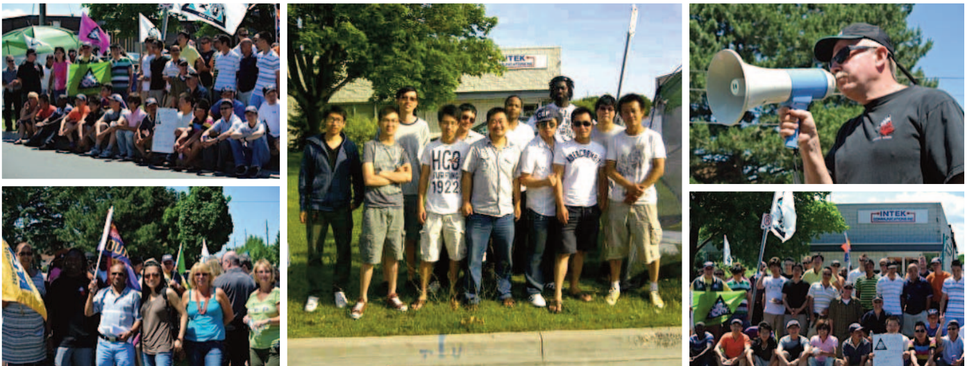
Members across Ontario at Intek Communications and DHT were locked out for 457 days in 2012.

This model of ‘social partnership’ relies on a high level of union density and collective bargaining coverage (usually in the neighbourhood of 80-90%) as well as general agreements that are negotiated between the major labour and employer federations which set baseline regulations for most employers and workers. These general agreements include provisions that set penalties for strike action undertaken while an agreement is in force. This arrangement implies that employers are free to replace striking workers during a labour dispute. In practice, however, the use of scabs in these countries is rare in the modern era, particularly since the threat of co-ordinated solidarity strikes by other unions, which strategically target an employer’s supply chains, tends to put a damper on employers’ willingness to deploy replacement workers.