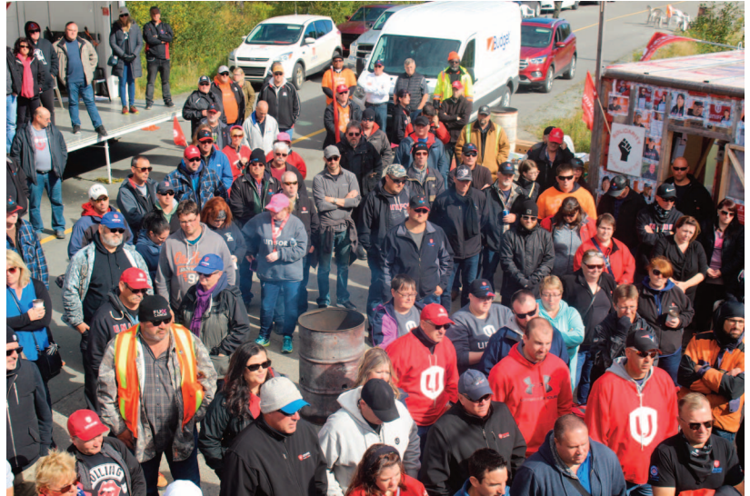
The crowd kept building as Unifor stood up to D-J Composites during a two year lockout.

However, more recent study by Duffy and Johnson (2009) used a larger data set from 1978 to 2003 to examine the impact of anti-scab legislation in Quebec, B.C. and Ontario on the frequency of work stoppages as well as their duration. In line with previous studies on the Canadian experience, they found that the incidence of work stoppages increased in the first two years after anti-scab legislation was introduced, but in contrast to these earlier studies, there was a significant and substantial reduction in the length of the work stoppages . Of all the variables they examined, including dues check-off, compulsory conciliation and mandatory strike votes, among others anti-scab legislation, along with bans on professional strike-breakers and reinstatement rights, had the most significant impact on the length of work stoppages, considerably reducing them. Notably, the authors also found that there was little to no evidence that there was any effect on days lost to work stoppages once anti-scab legislation was introduced, both in the first two years following its implementation and after it had been in effect for more than two years.