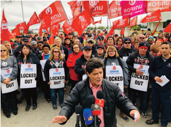
Jerry Dias tells locked out D-J Composite workers scabs are not crossing a Unifor picket line again.

At our National Convention in August 2019, more than a thousand Unifor delegates endorsed a resolution to undertake a national campaign to fight for anti-scab legislation in Canada. This resolution was proposed by Unifor Local 597, whose members working at DJ Composites in Gander, NL were locked out for 740 days – the second longest labour dispute in Unifor’s history. As noted above, the three longest disputes in Unifor’s history involved the use of scabs, a fact that speaks for itself when considering what effect scabs can have on the duration of labour disputes, and on the overall state of labour relations between workers and their employers.