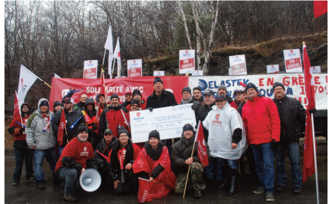
Presentation of a donation to the striking members of Local 1209 at Delastek at a solidarity demonstration in the streets of Grand-Mère, Quebec, on December 15, 2015.

We also know that beyond the numbers themselves, there are real working people out on the picket line, taking huge risks and fighting for themselves and their families. In Voices from the Picket Line , we are going to look at two real life case studies that document the experiences of Unifor members and how the use of scabs during labour disputes undermined workplace safety, increased the likelihood of conflict, dragged out disputes, and created lasting animosity that destabilizes labour relations.