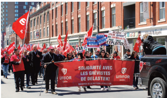
Walk in solidarity with the members of Local 1209 at Delastek in the streets of Trois-Rivières during Quebec Council on May 5, 2016.

In Spain, labour statutes do not regulate the use of replacement workers. Rather, the prohibition of scabs is by royal decree. This dates back to 1977 (RDL 17-1977, Article 6), wherein the decree specifies that, "As long as the strike lasts, the employer may not replace the strikers with workers