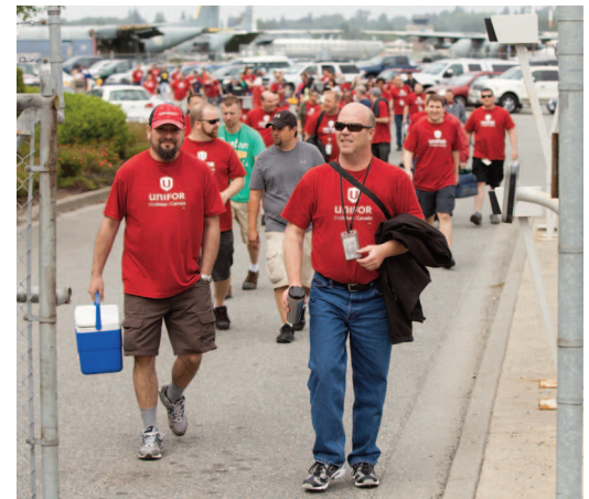
Unifor members walk off the job on day 1 of the strike at Cascade Aerospace in Abbotsford, B.C.

Section 109.1 (1977) of Quebec's Labour Code prohibits an employer from using scabs to perform the work of a member of the bargaining unit, whether those are externally contracted, recent hires (i.e. after negotiations begin), members of the bargaining unit, or any other employees at any of the employer's establishments with the exception of managers at the struck or locked out facility. 1 Despite serving as the strongest example of anti-scab legislation at the