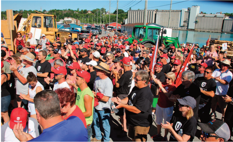
Hundreds of Unifor members traveled to a rally in support of workers at the salt mine in Goderich in 2018.

people, and still getting their product out, it's absolutely tipping the balance and the scales in the company's favour.