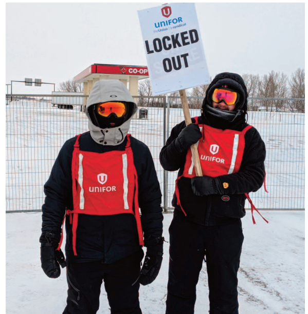
Members of Unifor Local 594 were forced to endure a longer lock-out in frigid conditions thanks to replacement workers.

The use of scabs tips the balance of power, and it really left us without many options. Local 594 is supposed to be their sole provider of labour. But with us locked out and their ability to replace us with replacement workers, it really took away the only leverage that we had. So we were kind of trapped out on the line. The company was not willing to bargain because they didn't feel any need to do that, as they were able to run the plant with their scabs and without us.