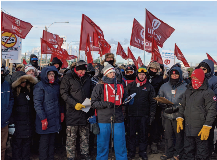
Unifor members from across Canada helped to bolster the picket lines at the Co-op Refinery lock-out.

So many families were impacted by this, freezing out on the picket line and looking up and seeing that helicopter. It was awful from the first day we saw those helicopters fly in. Watching them continue to fly in all day, every day. They would make low passes, I'm sure intentionally just for the psychological impact it would have on all of us. And the flight paths took them around the city, making sure that a massive percentage of the membership and everyone else in Regina was very aware of the helicopters and what was going on.