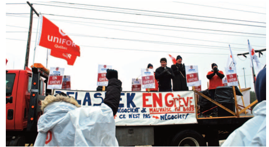
Speech by Jerry Dias at a solidarity event for Local 1209 members at Delastek on December 15, 2015.

All three provincial anti-scab laws made exceptions in the case of emergencies where health and safety are at risk or there is the risk of damage to property, machinery or the environment.