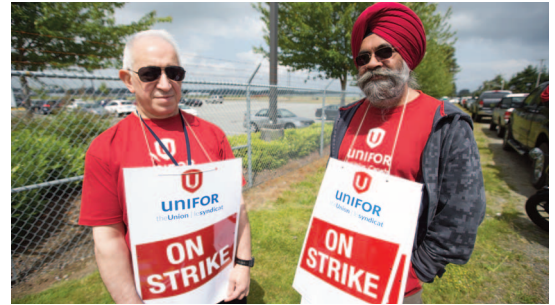
Unifor members on the picket line during the Cascade Aerospace strike in 2014.

Quebec’s anti-scabs laws effectively ban the use of any employee or contracted workers to perform the duties of a bargaining unit member, except for managers at the workplace, rendering it the most favourable to workers in the country. However, the loophole which allows managers to be deployed as scabs has been exploited by some employers to drag out disputes. This undoubtedly contributed to one of the longest labour disputes in Quebec’s history, when Delastek deployed managerial scabs to hold out against Unifor Local 1209, leading to a 35-month strike from 2015 to 2018. Likewise, workers at the ABI aluminum smelter in Bécancour, QC were locked out for 18 months from 2018 to 2019 by their employer with the help of scabs and the authorities’ failure to properly enforce anti-scab provisions. Ontario’s anti-scab legislation, now repealed, permitted the use of managers and non-bargaining unit employees as scabs, that (while limited) created an even more expansive pathway to potential disruptive labour relations during a dispute. Finally, B.C. laws – which allow all employees at the workplace to cross picket lines during a dispute – are the weakest of the three.