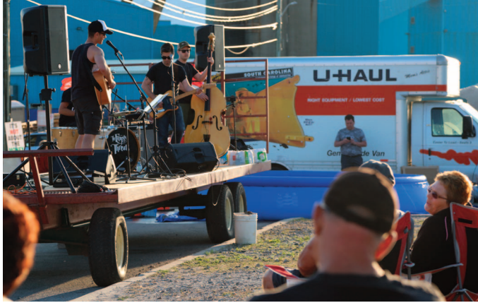
This is one of several concerts held on the picket line in Goderich to bring community member to the picket line in 2018.

Like any local union, at times we all don't agree on everything that is brought forward, whether it's from the union executive or from management. But when they do something like this, it brought our local so close together, especially when the gloom cut so deep.