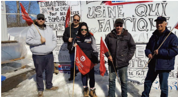
Unifor members in Grand Mere, Quebec spent 1074 days on the picket line.

In Canada, three provinces currently have or have had anti-scab legislation: Quebec, British Columbia and Ontario.